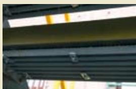
Kicker Tread® (underside)

For installation details, please go to the Technical section of our website: www.scotgrip.com