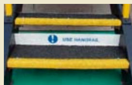
Scotgrip® Kicker Tread® with 'SignAlert' message 'Use Handrail'

For installation details, please go to the Technical section of our website: www.scotgrip.com