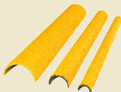
Scotgrip® ladder rung covers - round (LRCR)

For installation details, please go to the Technical section of our website: www.scotgrip.com