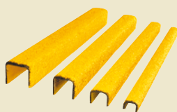
Scotgrip® ladder rung covers - square (LRCS)