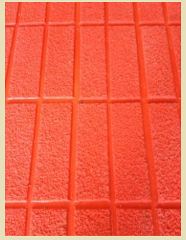
Scotgrip® Pipemate® with two-way drainage channels.