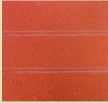
Scotgrip® high profile surface with one-way drainage channels.