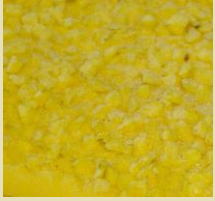
Scotgrip® high profile surface with no drainage channels.

Scotgrip® Rigmate® high profile surface provides excellent drainage, however if required we can supply one way and two way drainage channels.