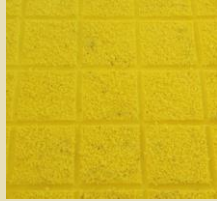
Scotgrip® high profile surface with two-way drainage channels.